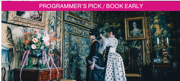
The Favourite (15) Fri 25 January – Thu 7 February Dir. Yorgos Lanthimos, UK, 2018, 119 mins. Cast. Olivia Coleman, Rachel Weisz, Emma Stone, Matthew Goold, Mark Gatiss.

Forget everything you think you know about this film. It is, in fact, a classic feminist comedy that was decades ahead of its time. Jane Fonda, Lily Tomlin and Dolly Parton star as three women who, sick of their egotistical, sexist manager, seek to change their all-female workplace for good.