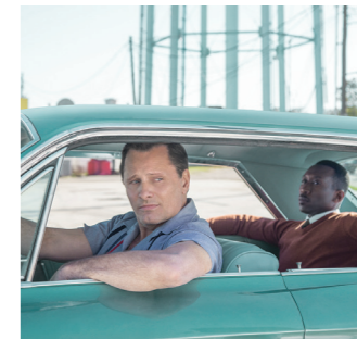
Green Book (tbc) Fri 22 – Thu 28 February Dir. Peter Farrelly, US, 2018, 130 mins. Cast. Mahershala Ali, Viggo Mortensen.

A relaxed, communicative dad, David isn't alarmed when his son Nic begins experimenting with marijuana; but when Nic's initially casual interest in drugs expands into an urgent addiction to crystal meth, the father and son's relationship is challenged to its core. A soulful and intensely moving drama about addiction and its tragic consequences.