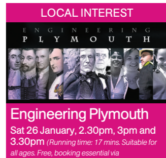
Engineering Plymouth Sat 26 January, 2.30pm, 3pm and 3.30pm (Running time: 17 mins. Suitable for all ages. Free, booking essential via www.plymhearts.eventbrite.co.uk )

Set in 1962, the film follows Italian-American Tony Lip, who is hired to chauffeur African-American pianist Dr. Don Shirley on a concert tour through the Deep South. Green Book is an uplifting true story that demands to be told on the big screen and succeeds in making its crucial subject of racial division in 1960s America into a smart, affecting and also charming film.