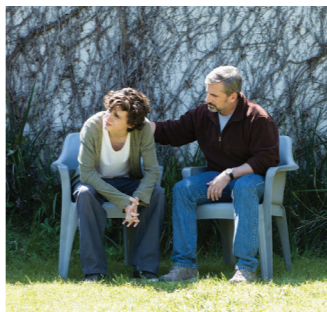
Beautiful Boy (15) Fri 8 – Thu 14 February Dir. Felix van Groenigen, US, 2018, 120 mins. Cast. Timothee Chalamet, Steve Carrell.

Robert Redford gives an unforgettable final performance as a smooth lifelong criminal in this based-on-a-true-story tale. Forrest Tucker has been to jail 18 times and now, at the age of 70, he's made yet another prison escape and is on a nationwide string of heists with the help of his charm and good manners.