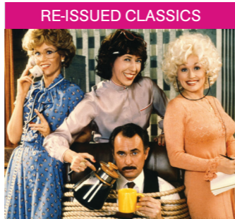
9 to 5 (15) Tue 22 – Thu 24 January Dir. Colin Higgins, US, 1980, 109 mins. Cast. Jane Fonda, Lily Tomlin, Dolly Parton.

Sebastián Lelio ( A Fantastic Woman ) makes his English-language debut with this powerful exploration of faith, sexuality and freedom told through the passionate love story between two women in London's Orthodox Jewish community.