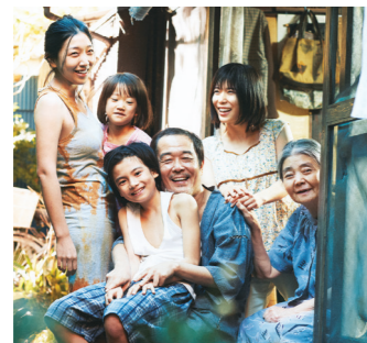
Shoplifters (15) Tue 15 – Fri 18 January Dir. Hirokazu Koreeda, Japan, 2018, 121 mins, subtitled. Cast. Lily Franky, Kirin Kiki.

Actor Paul Dano makes an impressive directorial debut with this elegant 1960s-set melodrama. Gorgeously performed and with beautiful production design and cinematography, this is a poetic coming-of-age tale of heartbreak, silence, and the terrifying realisation that your parents are only human.