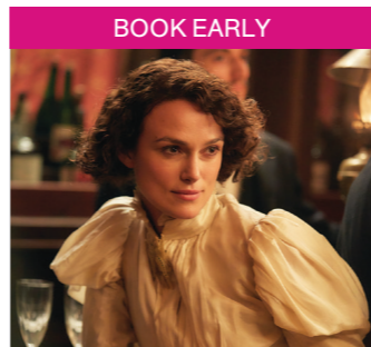
Colette (15) Fri 1 – Thu 7 February Dir. Wash Westmoreland, US, 2018, 112 mins. Cast. Keira Knightley, Dominic West, Fiona Shaw.

Guadagnino ( Call Me by Your Name ) pays homage to Dario Argento's 1977 horror classic with this delicious, dark - and feminist - reimagining. Unfolding in Berlin in the 70s, it finds Susie Bannion, a young American dancer, auditioning for a place in a prestigious school run by a group of women who may in fact be witches. Students are disappearing, and it's apparent that some kind of ancient violence lives in the school's walls - is Susie being groomed as a tool for the occult? With an eerily brilliant score by Thom Yorke and an earthy, muted colour palette of greens and pale pinks, this is a spellbinding look at corruption, innocence and female power that expertly blends filmmaking, dance and performance.