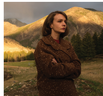
Wildlife (12A) Sat 12 – Sat 19 January Dir. Paul Dano, US, 2018, 105 mins. Cast. Jake Gyllenhaal, Carey Mulligan, Ed Oxenbould.

War correspondent Marie Colvin had a fearless approach to capturing human stories in war zones. This is a devastating portrait of a complex, brilliant woman, who sacrificed her own safety and happiness to bear witness to the very human cost of armed conflict.