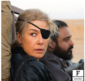
A Private War (tbc) Fri 22 – Thu 28 February Dir. Matthew Heineman, Jordan/UK, 2018, 106 mins. Cast. Rosamund Pike, Jamie Dornan, Stanley Tucci, Tom Hollander.

In a small town in Massachusetts in 1892, Lizzie Borden lives with her wealthy father and step-mother. When their new housemaid Bridget arrives, they develop a loving friendship that soon blossoms into a secret romance. But her father's strict rules and violent outbursts force Lizzie to breaking point.