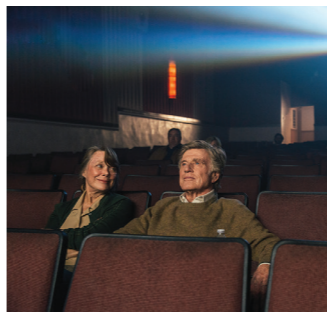
The Old Man and the Gun (12A) Fri 8 – Thu 14 February Dir. David Lowery, US, 2018, 93 mins. Cast. Robert Redford, Sissy Spacek, Casey Affleck, Tom Waits.

Guillaume Canet pokes fun at himself and real-life partner Marion Cotillard with wild abandon and doesn't hold back on lampooning his actor's ego and cinema's obsession with youth. It works beautifully and Cotillard more than matches Canet for making fun of her image in the media of a serious, slightly manic actress.