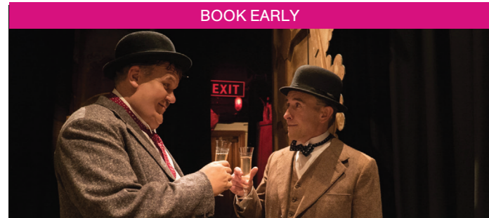
Stan and Ollie (tbc) Fri 11 January (OPENING NIGHT) – Thu 24 January Dir. Jon S. Baird, UK, 2018, 97 mins. Cast. Steve Coogan, John C. Reilly, Nina Arianda, Shirley Henderson.

In 1953, several years after their last film and with their celebrity on the wane, Stan and Ollie embark on a tour of British seaside towns and music halls. Surprised by the modesty of the bookings and cramped guesthouses, they struggle for audiences. But a series of TV guest spots and celebrity appearances soon rekindle interest in their genius and as the attention builds, so too do old resentments. Coogan and Reilly are a revelation; they nail the body language, mannerisms and routines the duo would have known in their sleep after decades performing together. A poignant study of lifelong male friendship and a fitting tribute to two of cinema's comedy giants.