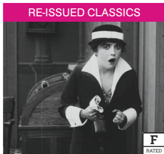
The Marvelous Mabel Normand (U) Sat 19 – Wed 23 January Dir. Various, US, 1913 – 27, 78 mins. Cast. Mabel Normand, Charlie Chaplin, Oliver Hardy.

In a corner of Tokyo, a family struggle to get by, barely making enough money to survive through petty crime. But, when Osamu and his son come across a little girl in the freezing cold, they welcome her with open arms. Rich, satisfying and deeply moving, this Palme d'Or winning film is a triumph of subtlety over spectacle.