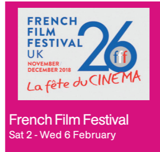
French Film Festival UK Sat 2 - Wed 6 February

Lanthimos ( The Lobster , The Killing of a Sacred Deer ) returns with his latest absurdly entertaining farce - a darkly funny court comedy about rivals vying for the affection of Queen Anne. It's the early 18th century, England is at war with France and Queen Anne's poor health finds her relying on her doting friend Lady Sarah (Weisz). When Abigail (Stone) arrives at the palace, her charm soon wins Anne's attention and Sarah and Abigail become fierce rivals for the Queen's affections in a wickedly funny game of one-up-womanship. Filthy and outrageous, a conventional royal drama this is not.