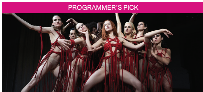
Suspiria (18) Fri 25 – Thu 31 January Dir. Luca Guadagnino, Italy/US, 2018, 153 mins. Cast. Tilda Swinton, Dakota Johnson, Mia Goth.

Everyone knows Charlie Chaplin and Buster Keaton, but where are the women in silent film comedy? The trailblazing Mabel Normand who starred in 167 shorts and 23 features gets her long-overdue moment in the spotlight in the BFI Comedy Genius tour. This is a package of four short films from the BFI National Archive.