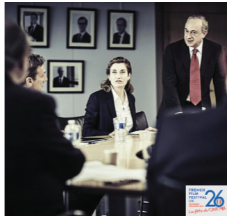
Woman Up! (15) Sat 2 February Dir. Tonie Marshall, France, 2017, 110 mins, subtitled. Cast. Emmanuelle Devos, Suzanne Clement, Richard Berry.

Festival pass: Get tickets for all 3 films for £15 per person. (Offer valid if tickets are purchased under one transaction)