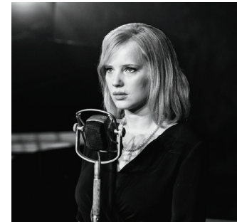
Cold War (15) Fri 19 - Thu 25 October Dir. Pawel Pawlikowski, Poland/France/UK, 2018, 89 mins, subtitled. Cast. Joanna Kulig, Tomasz Kot, Borys Szyc.