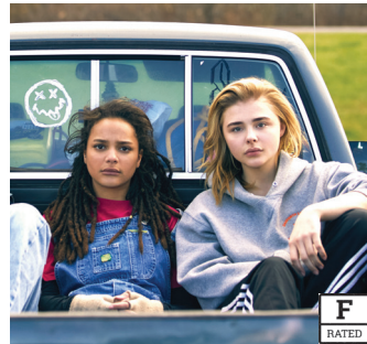
The Miseducation of Cameron Post (15) Sat 6 - Thu 11 October Dir. Desiree Akhavan, US, 2018, 92 mins. Cast. Chloe Grace Moretz, Jennifer Ehle, Sasha Lane.

The latest film from Xavier Beauvois ( Gods and Men ) is a powerful drama depicting a mother and daughter's struggles to keep the family farm together during the Great War. This richly compassionate, fiercely acted and beautifully shot period drama is about the battle of wills on the home front, as its characters struggle to maintain life at home.