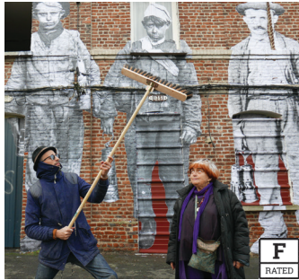
Faces Places (12A) Thu 27 Sep - Wed 3 October Dir. Agnès Varda, France, 2017, 94 mins, subtitled. With Agnès Varda, JR.