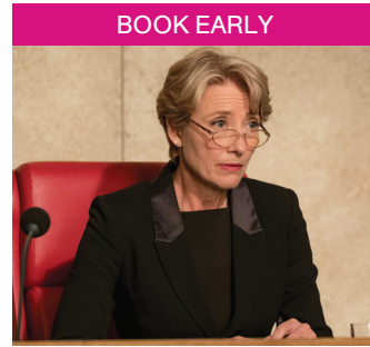
The Children Act (12A) Wed 3 - Wed 10 October Dir. Richard Eyre, UK, 2018, 105 mins. Cast. Emma Thompson, Stanley Tucci, Fionn Whitehead.

Spike Lee makes a triumphant return to form with this furious and often funny true-life tale of Ron Stallworth, a black cop who infiltrated the Ku Klux Klan in the late 70s. Lee clearly sees in Stallworth's story a way to take a temperature read on Trump's America.