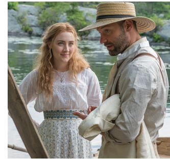
The Seagull (12A) Fri 12 - Thu 18 October Dir. Michael Mayer, US, 2018, 99 mins. Cast. Elizabeth Moss, Saoirse Ronan, Corey Stoll.

Hot on the heels of On Chesil Beach , Ian McEwan again adapts his own novel in this riveting drama about Fiona, a High Court judge who must decide if Adam a 17-year-old with leukaemia, should have a blood transfusion that will save his life - against his Jehovah's Witness beliefs.