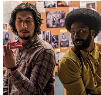
BlackKkKlansman (15) Tue 2 - Thu 4 October Dir. Spike Lee, US, 2018, 135 mins. Cast. John David Washington, Adam Driver, Topher Grace, Laura Harrier.

Screening as part of Reclaim the Frame. Thursday's screening will be introduced by BEV and followed by a post-film Q&A. Iconic filmmaker Agnès Varda and photographer JR embark on a road trip like no other exploring the villages and small towns of rural France and meeting its humble residents.