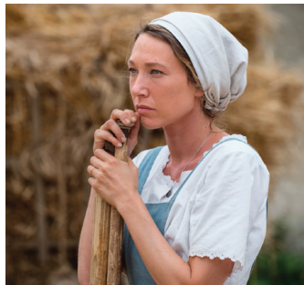
The Guardians (15) Fri 5 - Thu 11 October Dir. Xavier Beauvois, France, 2018, 138 mins, subtitled. Cast. Nathalie Baye, Laura Smet, Iris Bry.

Screening to complement Summer 1993. In a small Castilian village in 1940, six-year-old Ana attends a traveling movie show of Frankenstein and becomes possessed by the memory of it. This is a spellbinding film and one of the most visually arresting movies ever made.