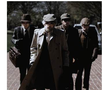
American Animals (15) Fri 26 October - Thu 1 November Dir. Bart Layton, UK/US, 2018, 117 mins. Cast. Evan Peters, Blake Jenner, Ann Dowd, Barry Keoghan.

Lenny Abrahamson ( Room ) directs this adaptation of Sarah Waters' novel. This gothic horror is set in a declining country house after World War II. Doctor Faraday is called to care for the inhabitants but their maladies are beyond his power to cure: they are haunted by a dying way of life, as well as something far more ominous.