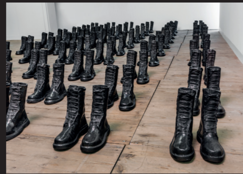
Antonio Vega Macotela, Study of Exhaustion - Study no. II - The Transmutation of Ashes, 2013. Courtesy the artist and Labor

KARST is Plymouth's largest independent contemporary art venue, comprising a free public gallery and artists' studios in the industrial Millbay area of Plymouth. KARST are at the forefront of the growing South West art scene, hosting critically acclaimed artists from around the world as well as supporting the city's own artistic talent.