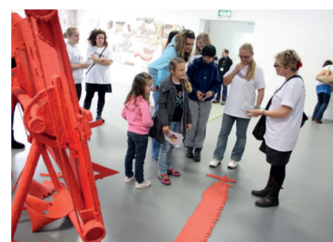
Plain Speaking Tours for BAS7, 2011.