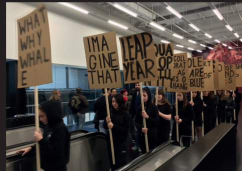
Peter Liversidge, Sign paintings, Performance, 12 minutes 32 seconds, Tate Modern April 2016.

Plymouth Arts Centre is a nationally acclaimed centre for contemporary art, independent cinema and creative learning. It commissions work by national and international artists, working with them to develop challenging and varied exhibitions complimented by our dynamic independent cinema programme.