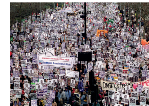
We Are Many